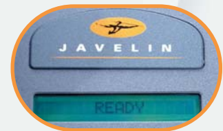
LCD display panel