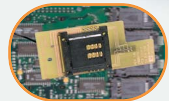
Integrated contact and contactless smart card encoding kit

Always use TrueColours™ certified media from NBS Technologies